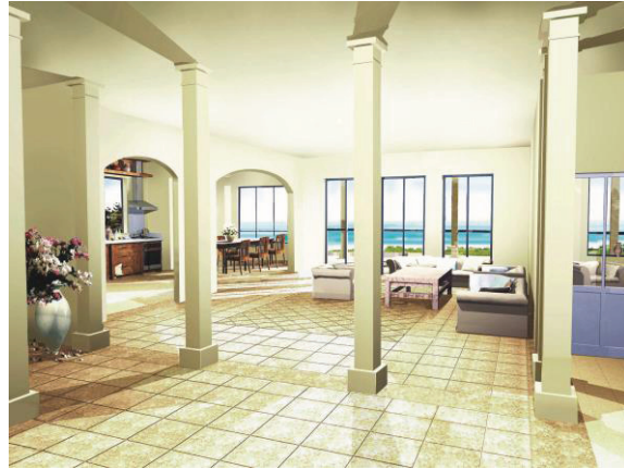
Figure 11: Type B - Entrance Floor. The entrance to the house from the path is from the opposite side of the garden and has a direct view to the sea through the living room and dining area.