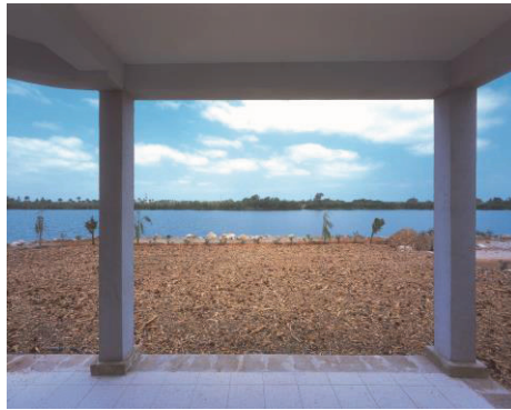
Figure 7: View of the water from a house's terrace.

To determine the level of each house so one could see the sea while sitting on the terrace, I used a crane to lift me up to where I could see the sea. This height was measured and the level of the house was determined accordingly.