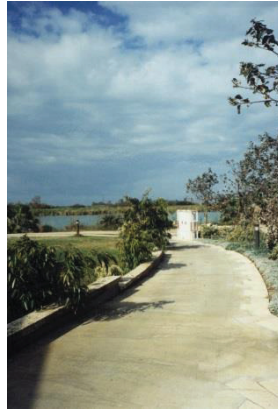
Figure 8: What dictated the course of the path was the wish to see the water from every spot along it.