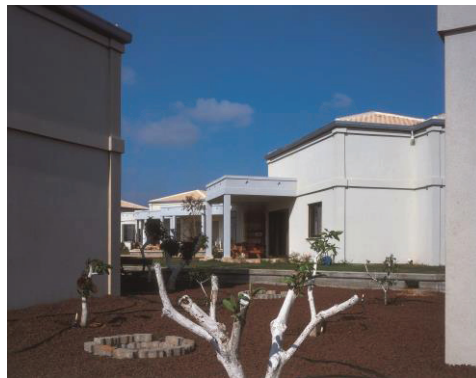
Figure 9: The “private” zone of each family (new in the collective), defined in a non-formal way by the paths running between the houses, generated a new pattern of behavior where each family started to grow its own garden.

The houses were arranged in small clusters sharing a communal open space. Unlike the traditional pattern in the kibbutz, where all open spaces - called ‘the lawn’ - are communal and buildings are dispersed arbitrarily in between, the secondary paths running between houses defined in a non-formal way with no fences the “private” zone of each family.