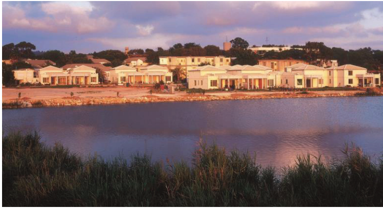
Figure 5: Panoramic view of the neighborhood, kibbutz Ma'agan Michael.

whereby political motives and egotistical ambitions create the kind of architecture that forms a real threat to the physical and human environment we live in.