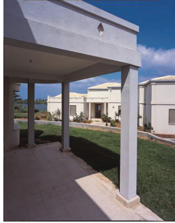
Figure 6: The position of each house was determined on the site in relation to the other houses to ensure an open view to the sea.