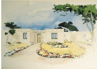
Figure 2: House Type A Figure 3: House Type B