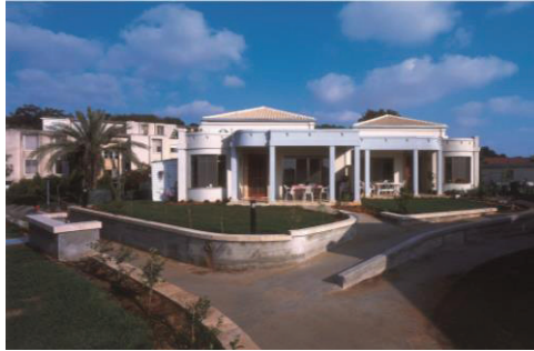
Figure 10: House Type A. The entrance to the house from the path is through the garden.

At this stage the site plan was completed. The position of each house in the neighborhood in relation to the paths and its position in relation to the sea produced different types of house plans. On plots where the entrance from the path was in the same direction as the sea view, type A plan emerged.